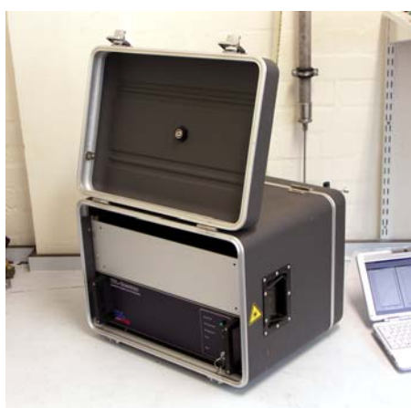
Field deployable versions available